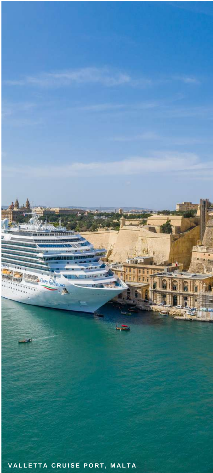
VALLETTA CRUISE PORT, MALTA