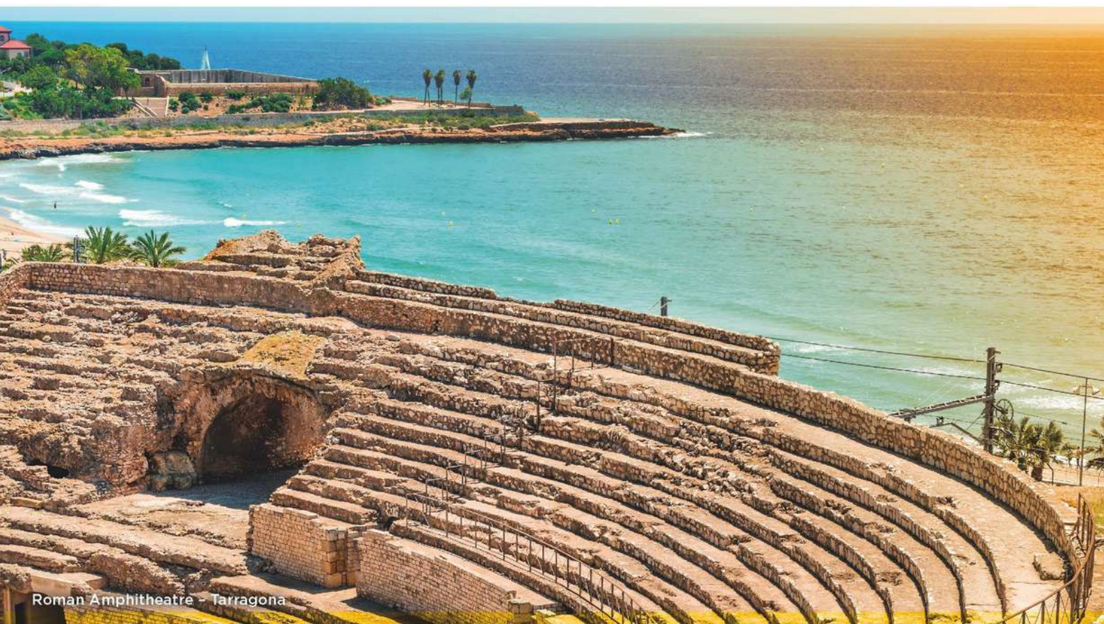
Roman Amphitheatre - Tarragona

Discover the Costa Daurada and the spectacular archaeological legacy of Roman Tarragona, the Tarraco archaeological ensemble, a UNESCO World Heritage Site. Fall in love at first sight with Catalan Modernism in Gaudi's hometown of Reus, or with the amazing Poblet monastery. Try outstanding wines and cavas and don't miss a fun-filled day at PortAventura World, home to three of Europe's leading theme parks.